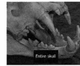
10. Wide shot of all the teeth showing wear, broken teeth, and teeth coloration.