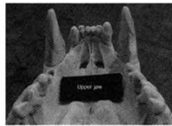
8. Upper jaw showing all the teeth and chipping of the enamel ridge on the back of the canines.