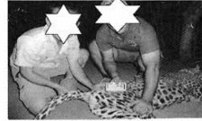
6. Hindquarters clearly showing the scrotum and visible predator hunting quota tag number.