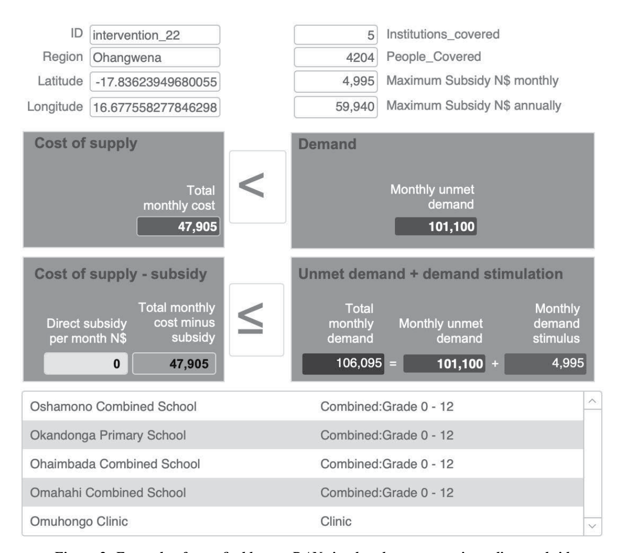
Figure 2: Example of a profitable new RAN site that does not require a direct subsidy

Direct subsidies are only offered if unmet demand and demand stimulation are not enough to tilt the balance towards profitability. Intervention 22 serves as an example where the unmet demand is already higher than the cost of a new RAN (Figure 2). However, the institutions within the reach of the RAN site will receive free Wi-Fi paid for by the USF in any case. A new RAN site costs N$47,905 per month, the total demand, including demand stimulation is N$ 106,095.