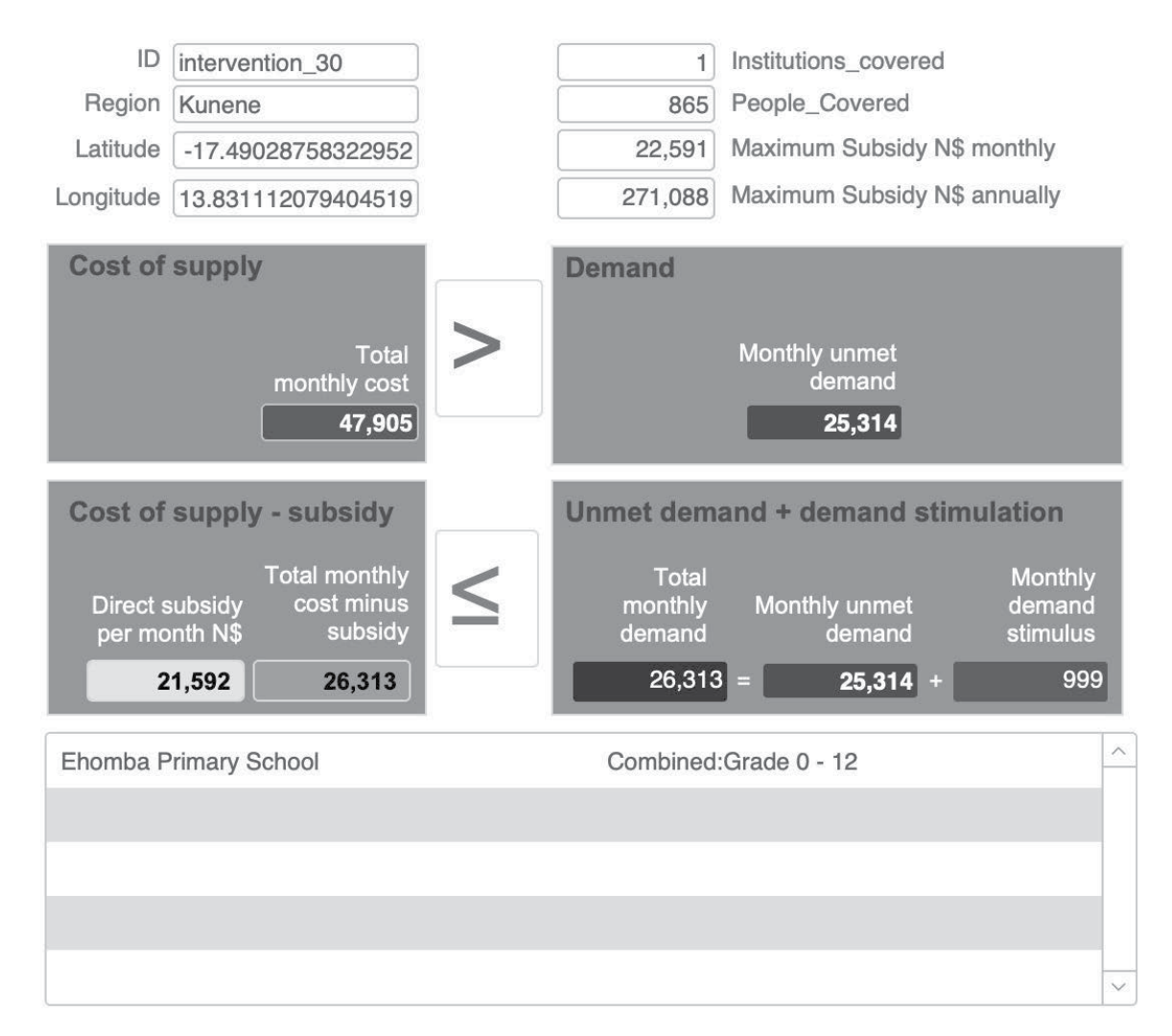
Figure 3: Example for a new RAN site that requires a direct subsidy

Figure 3 provides an example where the unmet demand and the demand stimulation are not enough to cover the monthly cost of a new RAN site. Only 865 people live within a 12 km radius of the new site and based on the average communication expenditure established by the National Household Income and Expenditure surveys (NHIES) would only generate N$ 24,314 per month. Thus a direct subsidy is required to make the new RAN site profitable.