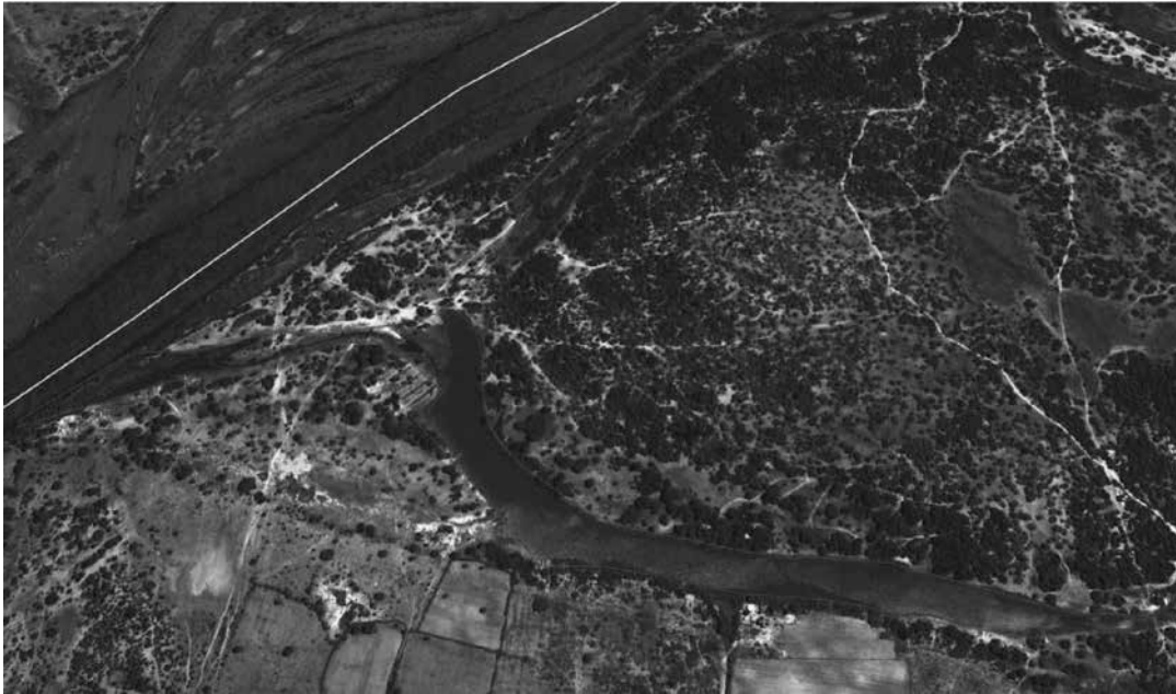
Figure 5: The boundary of the Shamange Fisheries Reserve in the Joseph Mbambangandu Conservancy, Kavango River. (Perimeter 5.43km).