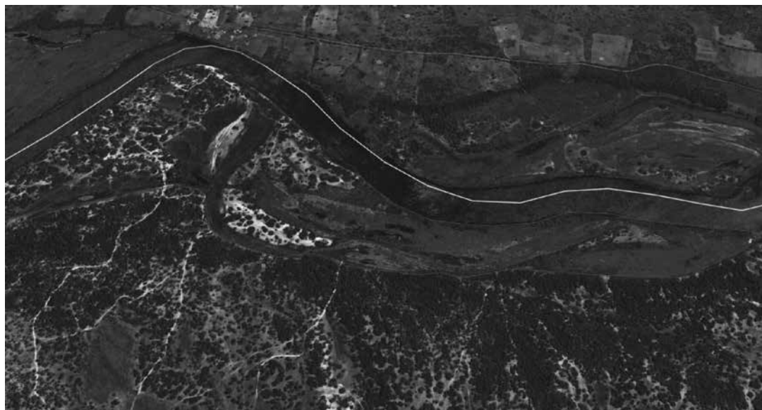
Figure 6: The boundary of the Situruturu Fisheries Reserve in the Joseph Mbambangandu Conservancy, Kavango River. (Perimeter 5.43km) (© 2018 Google LLC.).