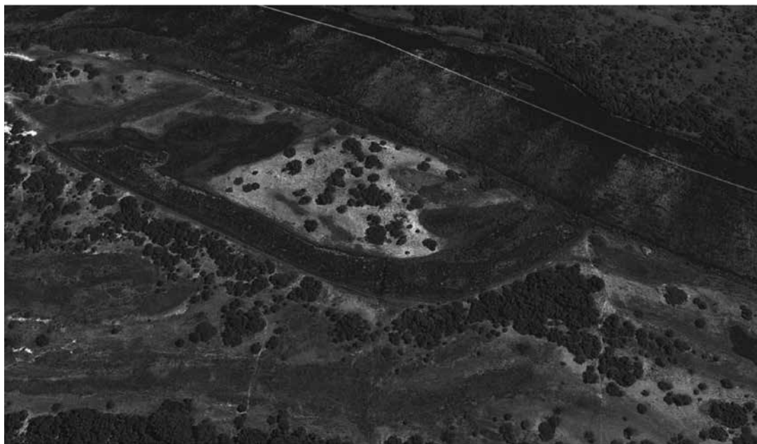
Figure 8: The boundary of the Sayipundu Fisheries Reserve in the Joseph Mbambangandu Conservancy, Kavango River. (Perimeter 1.87km).