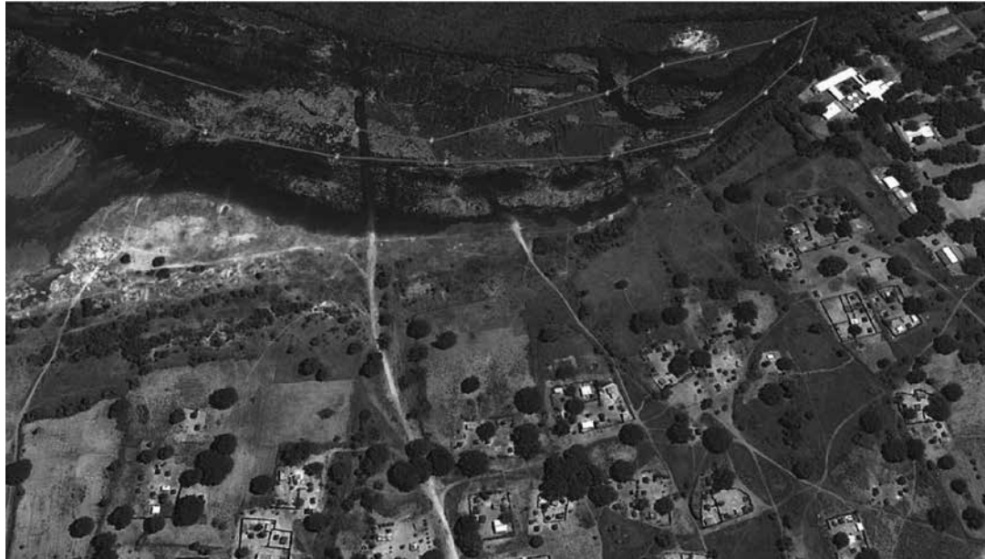
Figure 3: The boundary of the Kanyevea Fisheries Reserve in the Joseph Mbambangandu Conservancy, Kavango River. (Perimeter 1.57km).