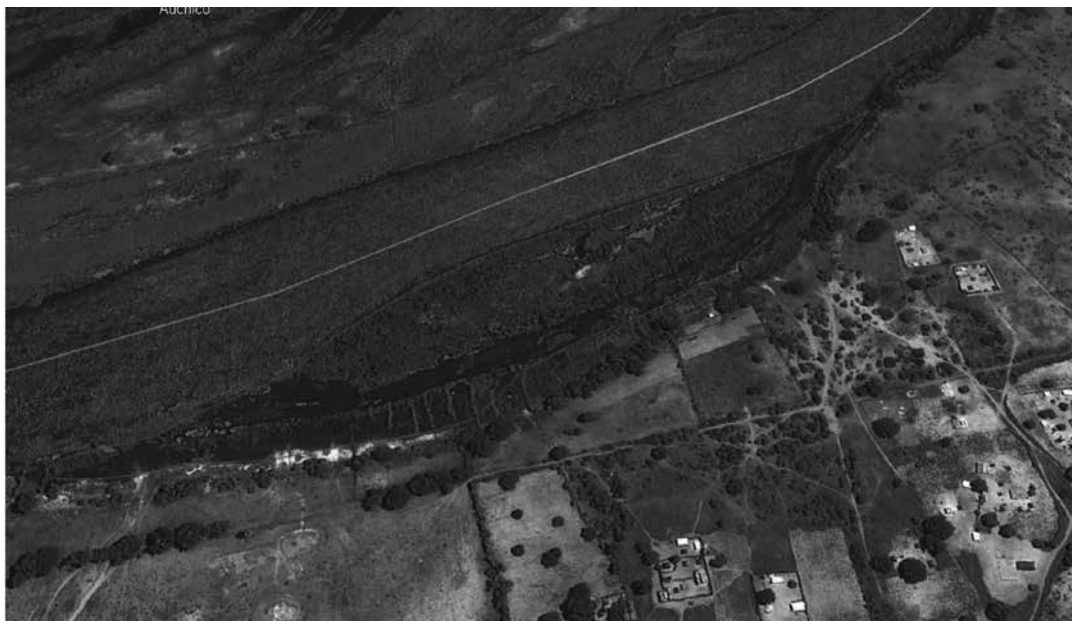
Figure 4: The boundary of the Shirudishagove Fisheries Reserve in the Joseph Mbambangandu Conservancy, Kavango River. (Perimeter 1.58km) (© 2018 Google LLC.).