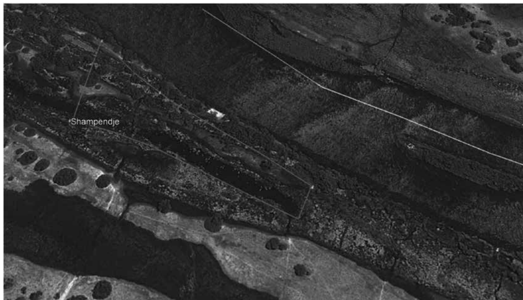
Figure 1: The boundary of the Shampendje Fisheries reserve, Kavango River. (Perimeter 0.84km) (© 2018 Google LLC.).