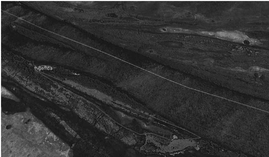
Figure 2: The boundary of the Ngemba and Sharudiva Fisheries Reserve in the Joseph Mbambangandu Conservancy, Kavango River. (Perimeter 0.95km).