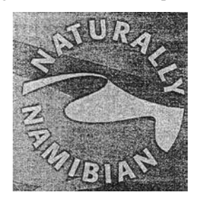
FILED: 11 May 2007

Address for service: MINISTRY OF TRADE AND INDUSTRY, Private Bag 13340, Windhoek, Republic of Namibia.