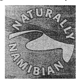
FILED: 11 May 2007

2007/0785 in class 10: Surgical; medical; dental and veterinary apparatus and instruments; artificial limbs; eyes and teeth; orthopaedic articles; suture materials in the name of MINISTRY OF TRADE AND INDUSTRY , a Namibian Government Ministry of The Brendan Simbwaye Square, 11 Goethe Street, Block B, Windhoek, Republic of Namibia. Address for service: MINISTRY OF TRADE AND INDUSTRY, Private Bag 13340, Windhoek, Republic of Namibia.