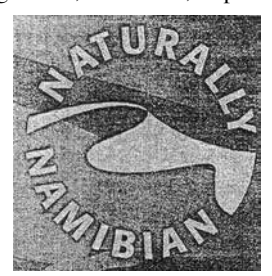
FILED: 11 May 2007

2007/0815 in class 40: Treatment of materials in the name of MINISTRY OF TRADE AND INDUSTRY , a Namibian Government Ministry of The Brendan Slmbwaye Square, 11 Goethe Street, Block B, Windhoek, Republic of Namibia. Address for service: MINISTRY OF TRADE AND INDUSTRY, Private Bag 13340, Windhoek, Republic of Namibia.