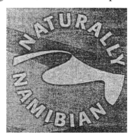
FILED: 11 May 2007

ment Ministry of The Brendan Simbwaye Square, 11 Goethe Street, Block B, Windhoek, Republic of Namibia. Address for service: MINISTRY OF TRADE AND INDUSTRY. Private Bag 13340, Windhoek, Republic of Namibia.