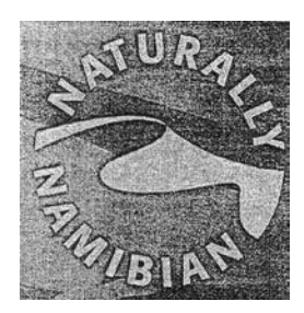
FILED: 11 May 2007

Address for service: MINISTRY OF TRADE AND INDUSTRY, Private Bag 13340, Windhoek, Republic of Namibia.