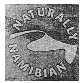
FILED: 11 May 2007

Address for service: MINISTRY OF TRADE AND INDUSTRY, Private Bag 13340, Windhoek, Republic of Namibia.