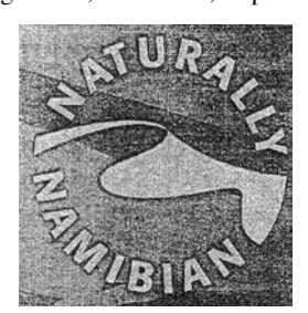
FILED: 11 May 2007

Address for service: MINISTRY OF TRADE AND INDUSTRY, Private Bag 13340, Windhoek, Republic of Namibia.