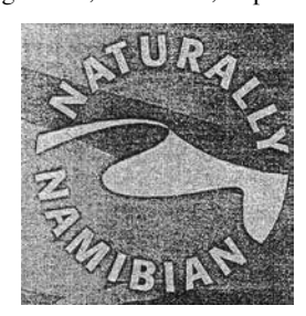
FILED: 11 May 2007

2007/0790 in class 15: Musical instruments in the name of MINISTRY OF TRADE AND INDUSTRY , a Namibian Government Ministry of The Brendan Simbwaye Square, 11 Goethe Street, Block B, Windhoek, Republic of Namibia. Address for service: MINISTRY OF TRADE AND INDUSTRY, Private Bag 13340, Windhoek, Republic of Namibia.