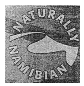
FILED: 11 May 2007

Address for service: MINISTRY OF TRADE AND INDUSTRY, Private Bag 13340, Windhoek, Republic of Namibia.