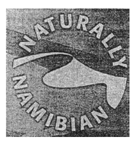
FILED: 1 1 May 2007

2007/0781 in class 6: Common metals and their alloys; metal building materials; transportable buildings of metal; materials of metal for railway tracks; non-electric cables and wires of common metal; pipes and tubes of metal; safes; goods of common metal not included in other classes; ores in the name of MINISTRY OF TRADE AND INDUSTRY , a Namibian Government Ministry of The Brendan Simbwaye Square, 11 Goethe Street, Block B, Windhoek, Republic of Namibia. Address for service: MINISTRY OF TRADE AND INDUSTRY, Private Bag 13340, Windhoek, Republic of Namibia.