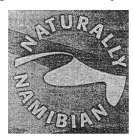
FILED: 11 May 2007

Address for service: MINISTRY OF TRADE AND INDUSTRY, Private Bag 13340, Windhoek, Republic of Namibia.