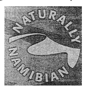
FILED: 1 1 May 2007

Address for service: MINISTRY OF TRADE AND INDUSTRY, Private Bag 13340, Windhoek, Republic of Namibia.