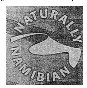
FILED: 11 May 2007

Address for service: MINISTRY OF TRADE AND INDUSTRY, Private Bag 13340, Windhoek, Republic of Namibia.