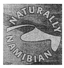
FILED: 1 1 May 2007

Address for service: MINISTRY OF TRADE AND INDUSTRY, Private Bag 13340, Windhoek, Republic of Namibia.