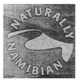
FILED: 11 May 2007

Address for service: MINISTRY OF TRADE AND INDUSTRY, Private Bag 13340, Windhoek, Republic of Namibia.