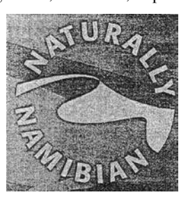
FILED: 11 May 2007

Address for service: MINISTRY OF TRADE AND INDUSTRY, Private Bag 13340, Windhoek, Republic of Namibia.