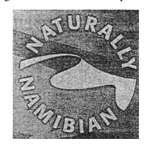
FILED: 11 May 2007

Address for service: MINISTRY OF TRADE AND INDUSTRY, Private Bag 13340, Windhoek, Republic of Namibia.