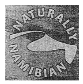
FILED: 11 May 2007

2007/0802 in class 27: Carpets. rugs, mats and matting, linoleum and other materials ror covering eiciing floors in the name of MINISTRY OF TRADE AND INDUSTRY , a Namibian Government Minstry of The Brendan Simbwaye Square. 11 Goethe Street. Block B, Wiudhoek. Renublic of Namibia. Address for service: MINISTRY OF TRADE AND INDUS-TRY, Private Bag 13340, Windhoek, Republic of Namibia.