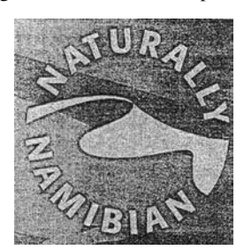
FILED: 11 May 2007

Address for service: MINISTRY OF TRADE AND INDUSTRY, Private Bag 13340, Windhoek, Republic of Namibia.