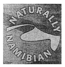
FILED: 11 May 2007

Address for service: MINISTRY OF TRADE AND INDUSTRY, Private Bag 13340, Windhoek, Republic of Namibia.