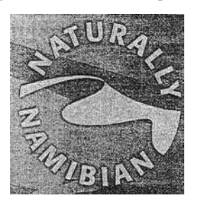
FILED: 11 May 2007

2007/0820 in class 45: Personal and social services rendered by others to meet the needs of individuals; security services for the protection of property and individuals in the name of MINISTRY OF TRADE AND INDUSTRY , a Namibian Government Ministry of The Brendan Simbwaye Square, 11 Goethe Street, Block B, Windhoek, Republic of Namibia. Address for service: MINISTRY OF TRADE AND INDUSTRY, Private Bag 13340, Windhoek, Republic of Namibia.