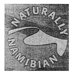
FILED: 11 May 2007

2007/0813 in class 38: Telecommunications in the name of MINISTRY OF TRADE AND INDUSTRY , a Namibian Government Ministry of The Brendan Simbwaye Square, 11 Goethe Street, Block B, Windhoek, Republic of Namibia. Address for service: Ministry of Trade and Industry, Private Bag 13340, Windhoek, Republic of Namibia.