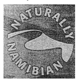
FILED: 11 May 2007

Address for service: Ministry of 'Trade and Industry. Private Bag 13340, Windhoek. Republic of Namibia.