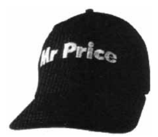
FILED: 17 November 2005

Address for service: ADAMS & ADAMS, c/o 12 Love Street, Windhoek, Namibia.