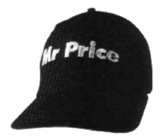
FILED: 17 November 2005

2005/2264 in Class 25: Articles of clothing, including footwear; in the name of MR PRICE GROUP LIMITED of Upper Level, North Concourse, Durban Station, 65 NMR Avenue, Durban, Kwazulu/Natal, Republic of South Africa. Address for service: ADAMS & ADAMS, c/o 12 Love Street, Windhoek, Namibia.