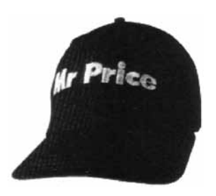
FILED: 17 November 2005

Registration of this trade mark shall give no right to the exclusive use of the representation of a "CAP" as such and apart from the particular representation shown in the mark.