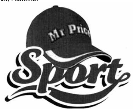
FILED: 25 October 2007

2007/2085 in Class 42: Advertising; business management; business administration; office functions; offering for sale and the sale of goods in the retail and wholesale-trade; in the name of MR PRICE GROUP LIMITED a South African company of Upper Level, North Concourse, Durban Station, 65 NMR Avenue, Durban, Kwazulu/Natal, Republic of South Africa. Address for service: ADAMS & ADAMS, c/o 12 Love Street, Windhoek, Namibia.