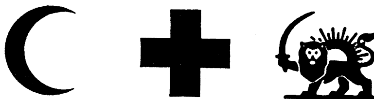
Fig. 2: Distinctive emblems in red on a white ground

The distinctive emblem (red on a white ground) shall be as large as appropriate under the circumstances. For the shapes of the cross, the crescent or the lion and sun*, the High Contracting Parties may be guided by the models shown in Figure 2.