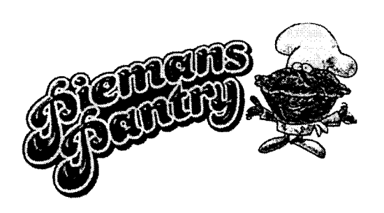
FILED: 5 SEPTEMBER 2000

Address for service: Messrs. JOHN & KERNICK, P O Box 864, Windhoek, Namibia.