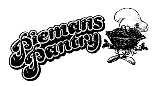
FILED: 5 SEPTEMBER 2000

Associated with nos. 00/1283 and 00/1281