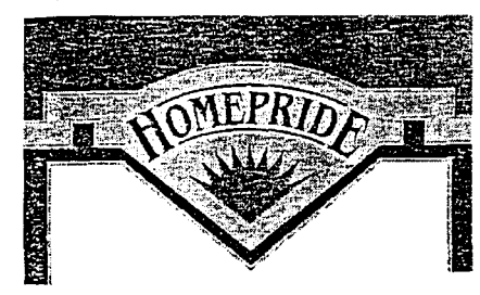
FILED: 12 APRIL 1995

Address for service: Messrs ADAMS & ADAMS, c/o 5th Floor, Namdeb Centre, Independence Avenue/Bülow Street, Windhoek, Namibia.