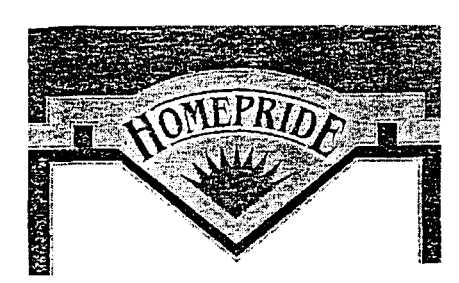
FILED: 12 APRIL 1995

Address for service: Messrs ADAMS & ADAMS, c/o 5th Floor, Namdeb Centre, Independence Avenue/Bülow Street, Windhoek, Namibia.