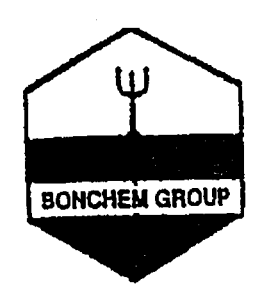
FILED: 3 SEPTEMBER 1997

Address for service: Messrs ADAMS & ADAMS, c/o 5th Floor, Namdeb Centre, Independence Avenue/Bülow Street, Windhoek, Namibia.