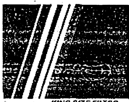
KING SIZE FILTRO

Registration of this trade mark shall give no right to the exclusive use of the words "KING SIZE FILTER" or the device of a GLOBE, but shall give exclusive rights to the globe device depicted in the mark attached to the application.