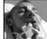
TOBACCO SMOKING KILLS