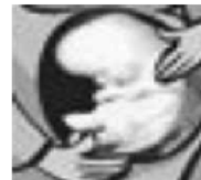
SMOKING IS DANGEROUS TO THE UNBORN BABY