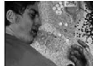
SMOKING IS DANGEROUS TO YOUR HEALTH