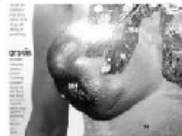
SMOKING CAUSES BREAST CANCER