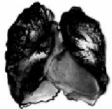
SMOKING DAMAGES YOUR LUNGS