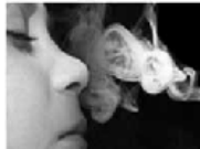
SMOKING IS DANGEROUS TO YOU AND NON- SMOKERS