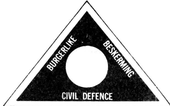
10. (Municipal coat of arms (For use by members of administrative and executive services))

Signs Nos. 1 to 10 above shall be of the same sizes and colours as the sign described in Schedule D.