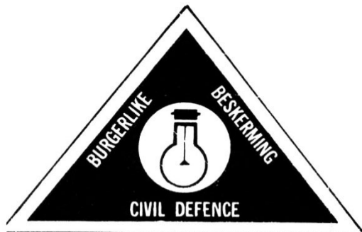
3. Electrical Services