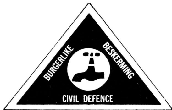
4. Water Services