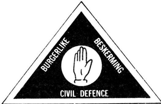
5. Traffic Control