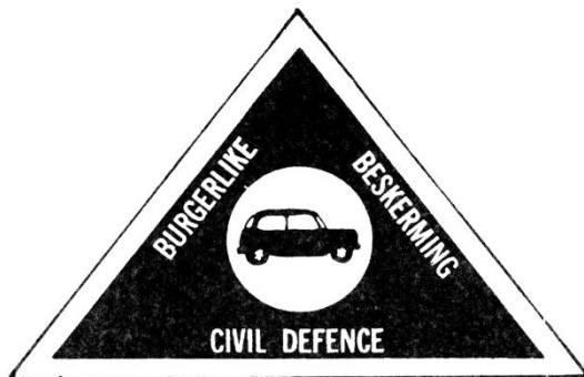
9. Transport Services