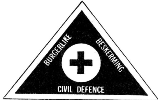
6. First Aid