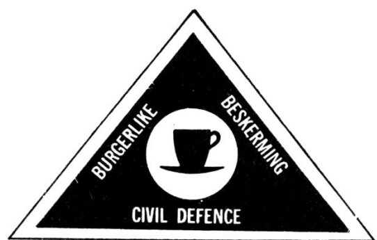
8. Care Services