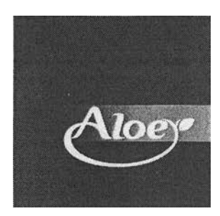
FILED: 17 September 2007

Address for service: SPOOR & FISHER, c/o H.D. BOSSAU & CO, 49 Feld Street, Windhoek, Republic of Namibia.