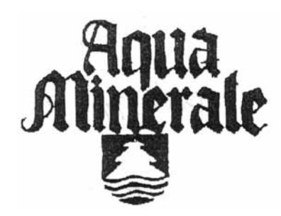
FILED: 22 February 2006