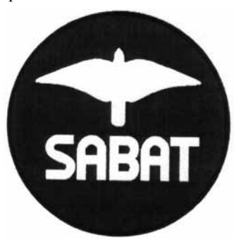
FILED: 16 November 2006

Address for service: ADAMS & ADAMS, 12 Love Street, Windhoek, Republic of Namibia.