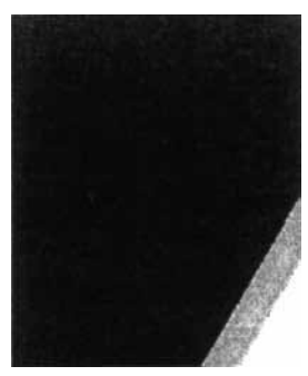
FILED: 9 March 2006

Address for service: ADAMS & ADAMS, c/o 12 Love Street, Windhoek, Namibia.