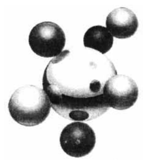
FILED: 16 November 2006

2006/1931 in class 02: Paints, varnishes, lacquers; preservatives against rust and against deterioration of wood; colorants; mordants; raw natural resins; metals in foil and powder form for painters, decorators, printers and artists; in the name of SASOL LIMITED , a South African company NO. 79/03231/06 of 1 Sturdee Avenue, Rosebank, Johannesburg, Gauteng. Address for service: ADAMS & ADAMS, 12 Love Street, Windhoek, Republic of Namibia.