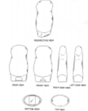
FILED: 7 October 2004

& JOHNSON , a corporation organized and existing under the laws of the State of New Jersey, One Johnson & Johnson Plaza, New Brunswick, New Jersey, United States of America. Address for Service: SPOOR & FISHER, c/o Lorentz & Bone, 19 Strübel Street, Frans Indongo Gardens, Windhoek, Namibia, 9001.